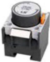
Air pressure timer

It is attached to the head-on of the magnetic contactor. It uses the principle of air pressure and it is delayed by the set time after the magnetic contactor is inserted and released and then the auxiliary contact of the Pneumatic timer is reversed