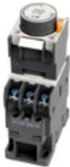
Combination with MC

It is attached to the head-on of the magnetic contactor. It uses the principle of air pressure and it is delayed by the set time after the magnetic contactor is inserted and released and then the auxiliary contact of the Pneumatic timer is reversed